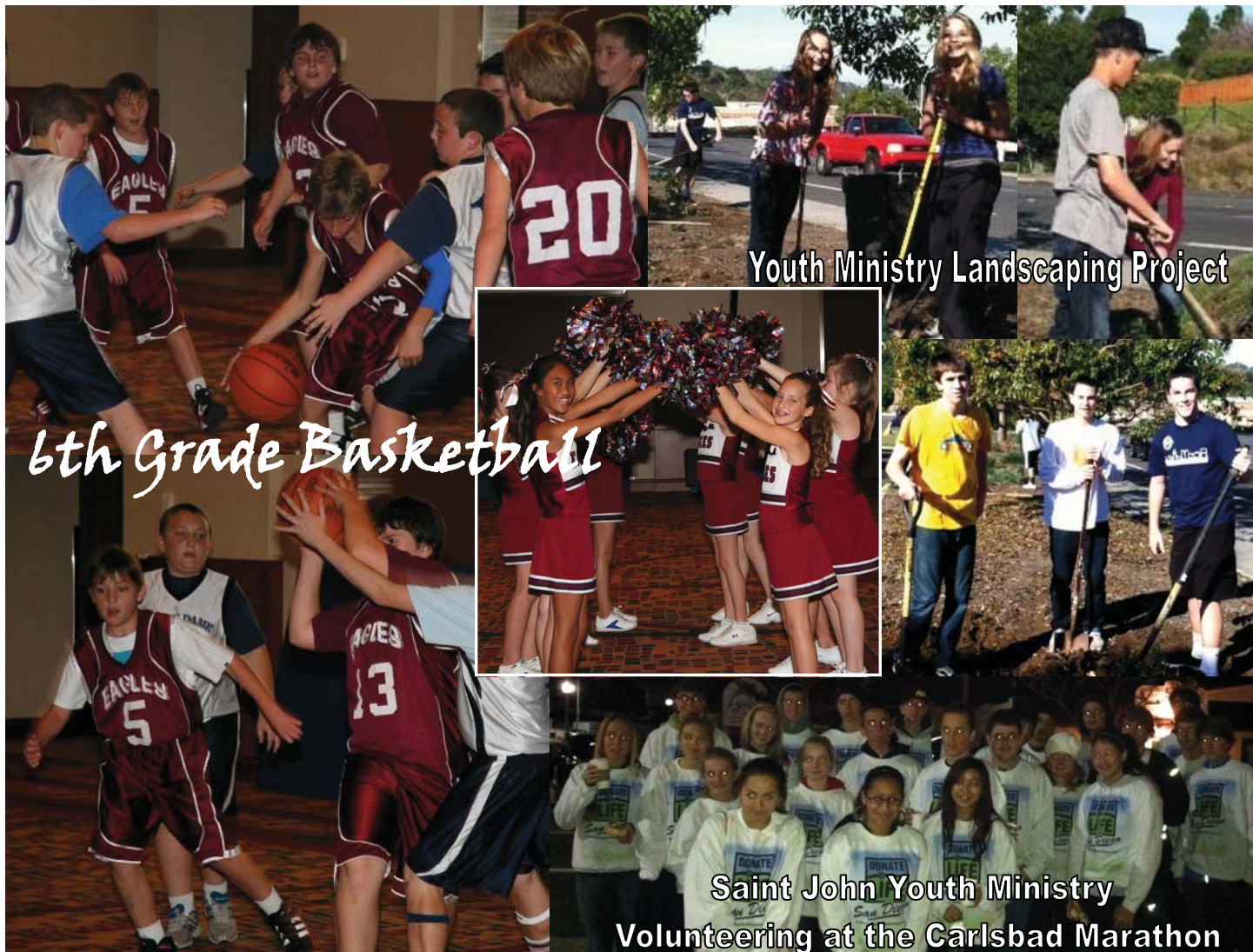
6th Grade Basketball