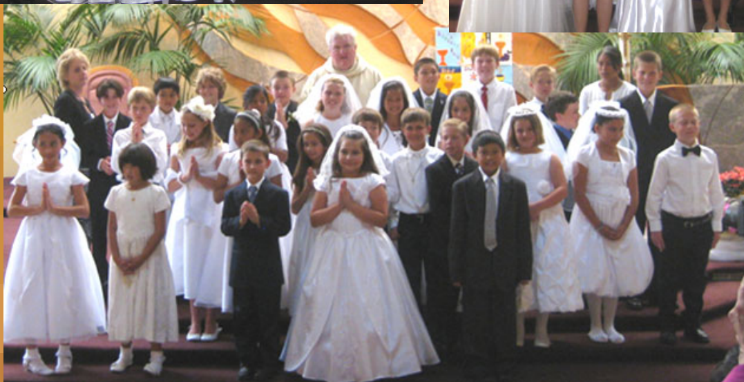
Religious Education First Eucharist 2011